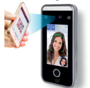
QR Code Scanning for Visitors